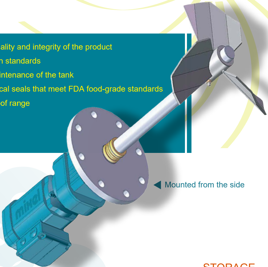
Mounted from the side

Suitable for wine and milk and other large volume tanks Suitable for tanks ranging from 10m³ to 270m³